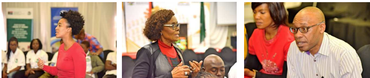
Mpumalanga workshop - Picture 1: Commissioner Doms Picture 2: Commissioner Mocumi Picture 3: Commissioner Molokwane and Secretary of National Planning Mr Matona

The Children's National Development Plan (NDP) project is aimed at giving the children of South Africa an opportunity to express their views about the NDP. Taking into account resource and time constraints, the project is qualitative rather than quantitative in that it engaged with selected groups of children in each province. Thus far, five workshops have been conducted — Western Cape (an additional workshop was conducted in the Groot Drakenstein Correctional Facility), Gauteng, Mpumalanga and KwaZulu-Natal. The workshops were led by Commissioner Nomdo with the support of other commissioners and members of the National Planning Commission (NPC) secretariat. The purpose of this child-friendly, interim report is to share the process and inputs obtained from children thus far. A more detailed paper or set of papers will be produced after the other workshops have been concluded.