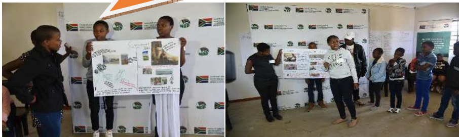
Pictures 22-23: Vision 2030 from KwaZulu Natal

2030: “A cure for HIV and other deadly diseases like TB and Cancer can do the country some good.”