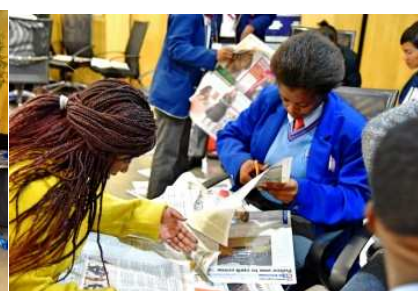
Picture 7: Discussing dignity rights for people with disability in Western Cape Picture 8: Roleplaying adolescent challenges in Gauteng Picture 9: Newspaper cuttings of political figures in Gauteng