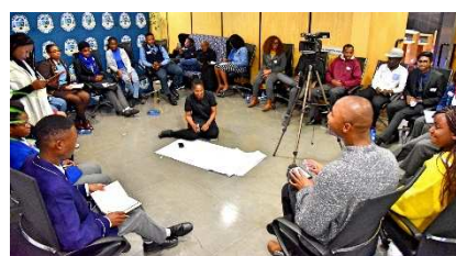
Picture 4: Branches of government tree in Mpumalanga Picture 5: Levels of government cake in Mpumalanga Picture 6: Discussing key priorities in Gauteng