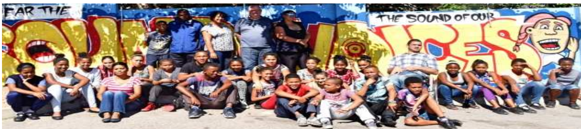
Picture 14: Group photo in Western Cape