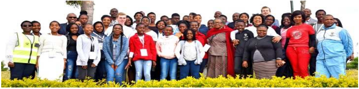
Picture 13: Group photo in Mpumalanga